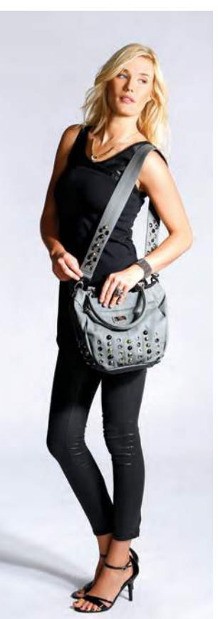
c. Carmel - Classic - $64.95 f. Lincoln - Demi - $79.95