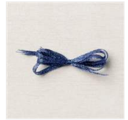
Starry Sky 1/8" (3.2 Mm) Metallic Woven Ribbon - 159198