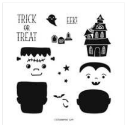
Tricks & Treats Photopolymer Stamp Set (English) - 162223