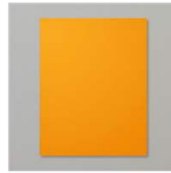
Pumpkin Pie 8-1/2" X 11" Cardstock - 105117