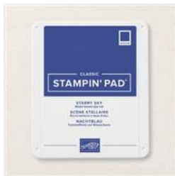
Starry Sky Classic Stampin' Pad - 159212