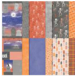
Them Bones 12" X 12" (30.5 X 30.5 Cm) Designer Series Paper - 162215