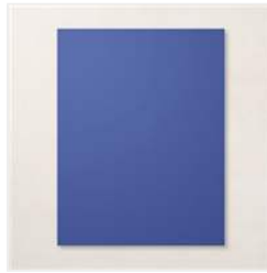
Starry Sky 8-1/2" X 11" Cardstock - 159263