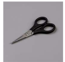
Paper Snips Scissors - 103579